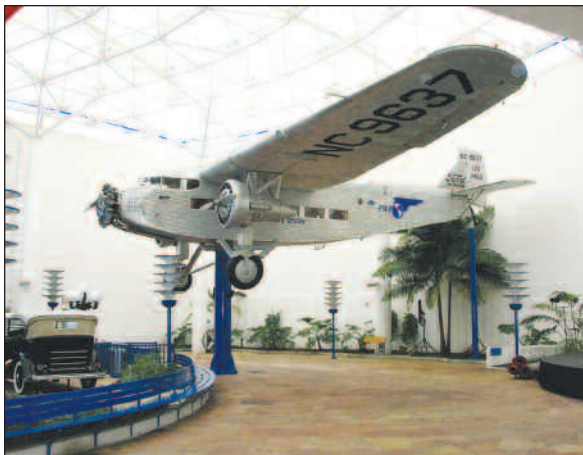
A grand old classic of the skies...the Ford 5-AT-B Trimotor...the largest civil aircraft when it started hauling passengers and mail in 1926. No surprise...they called it 'The Tin Goose'. Just one of 70 terrific exhibits at the amazing Air and Space Museum.

It has been chosen an 'Historic Hotel of America'. It was built in the 1920's as the Pickwick Hotel. Don't be put off by the original exterior...the terra-cotta brick dates it.