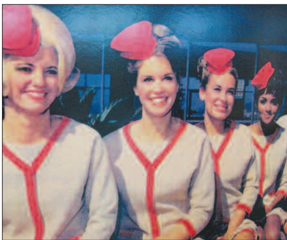
Some of the 'stews' (the abbreviation for 'stewardesses'..as they were called in those days) of PSA..Pacific Southwest Airways. Non-PC now..but that's what these ladies we flew up and down California with were called..before they became 'flight attendants'. Not only attractive...they were excellent at the job.