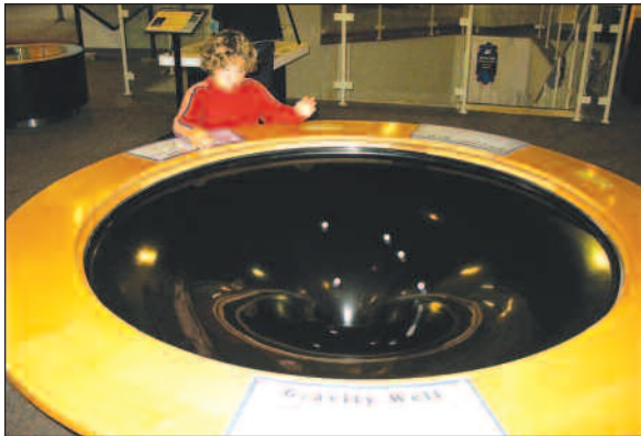
A young lad experiments with gravity at the Ruben Fleet Science Center...which offers all ages a hands-on relationship with science.

There are old downtown hotels throughout the US that have been re-done...but not many so completely re-done! Check out the little things in a Sofia room...comfy mattresses... towels-large and thick...great shower heads...plasma TV screens and toilets with the latest turbo-flush efficiency.