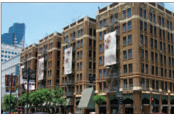
The Sofia Hotel...in the middle of everything downtown. It was originally built in 1926...the 2nd in the Pickwick Hotel chain. They built hotels to support their Pickwick Bus Lines...which eventually became Greyhound. That's how it received the 'Historic Hotels of America' designation. Nothing old about it now. They closed the hotel down for a year...to completely re-do it and its 211 rooms. It reopened last year.

There are a number of cruises available on the Bay that surrounds much of San Diego. A different experience is a ride/cruise in a 'Seal'. It's a boat and tour bus modeled after a WW2 amphibious 'Duck'. 'The Seal' ( http://www.trolleytours.com/San-Diego/seal-tours.asp )