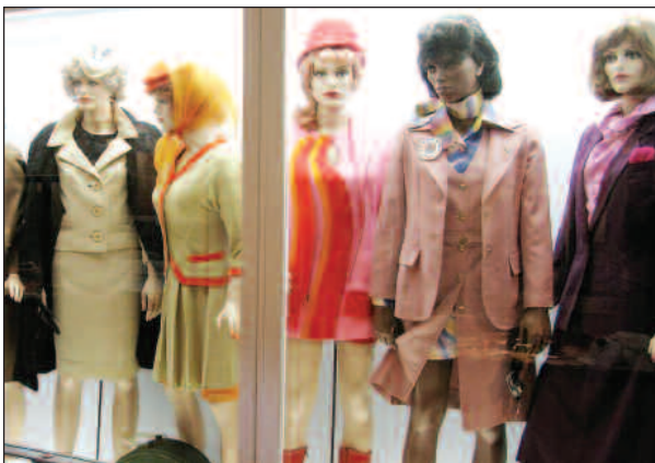
The uniforms worn over the years by the PSA attendants. They became well-known (and admired) for the mini skirts. The airline took off in 1949 and had a great run until deregulation forced it into a sale to US Air in 1988.

However...enter and enjoy the delights of the major upgrades that were finished just a year ago. Rates run from $159. to $215.