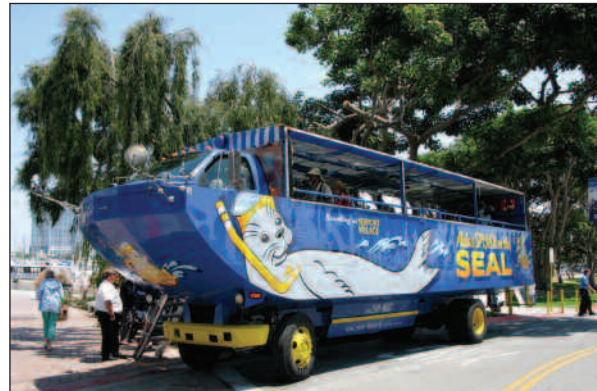
Looking ungainly and ugly...a tour in the 'Seal' is a great way to see San Diego's land and sea. Although taken from the WW2 amphibious 'Ducks' these are all new tourist delights.

The final port for the USS Midway ( www.midway.org ) is a live exhibit not to be