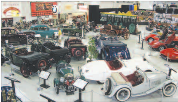
The San Diego Automotive Museum...is as outstanding a collection as the Air and Space Museum. World class...in fact. Don't kick the tires...but enjoy this tribute to what these 4-wheel wonders have done to mold our society.