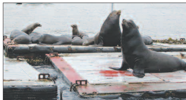
The 'Seal' sails out to visit the (real) seals of Pt Loma. They bark at the passengers...and carry on with a show that delights all aboard.

San Diego's downtown is easily walkable...the highlight...the popular Gaslamp District ( www.gaslamp.org ) and also within downtown...PETCO Park...home of baseball's Padres. Altho much more vertical...with some beautifully designed high-rises...still...at street